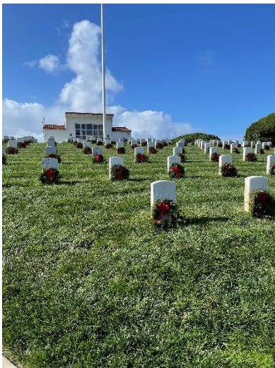
Wreath Across America at Fort Rosecrans.

It's not too late to contribute to Wreaths Across America to honor our fallen heroes here at Fort Rosecrans Cemetery. There are never enough wreaths. The cost is $15 per wreath and the garden club gets $5 from each wreath purchased. You can contribute at www.wreathscrossamerica.org and at the local sponsorship line put Point Loma Garden Club. If you want to help with the laying of the wreaths, you can sign up on their website. They will be laying the wreaths on December 17.