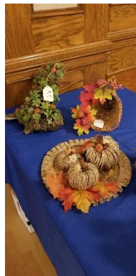
Items for sale on back table