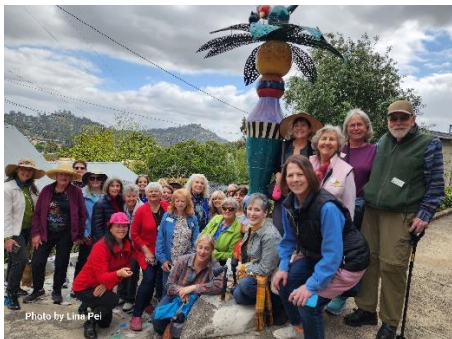
Petals of Madrigal