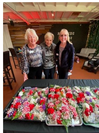
Check out all the flowers