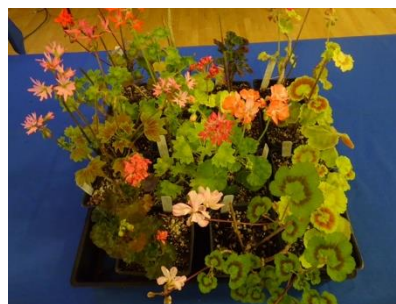
Some of her geraniums.