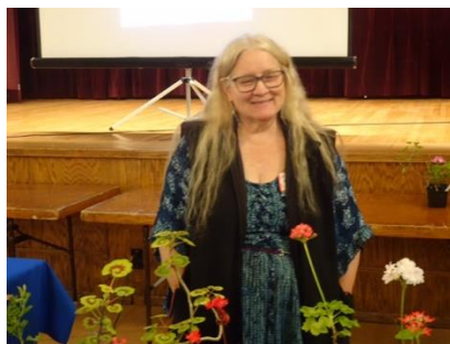
The speaker at the April meeting