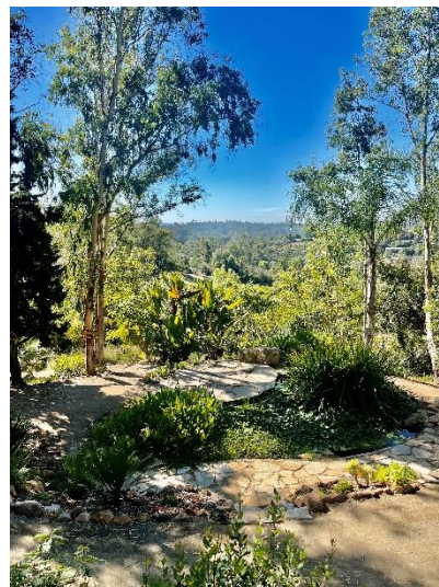
The views from the Alta Vista Gardens