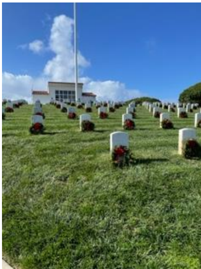
The wreaths from a previous year at Fort Rosecrans

https://www.wreathscrossamerica.org/pages/44925/overview/?relatedId=0