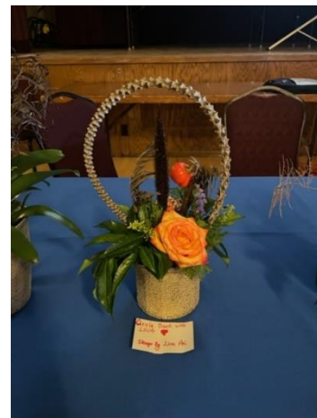
Centerpiece for the food Table