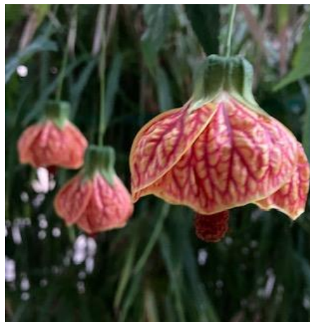
Tiger's eye Abutilon from Colleen Casey