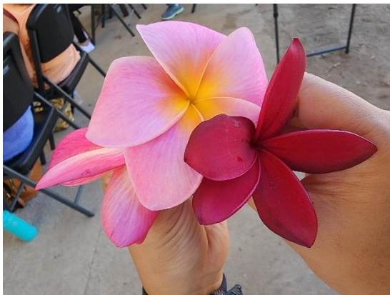
Plumerias from Atkinson Plumerias