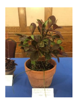
African Milk Bush-Shyla Crowson