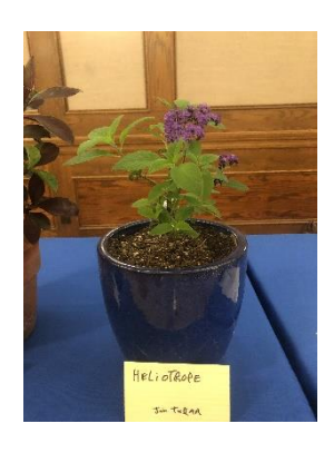
Frizzel Sizzle - Sherry Hebert