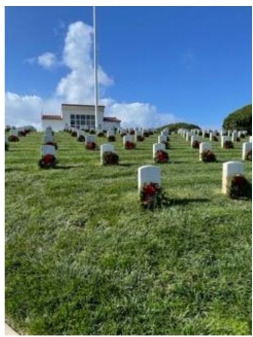
The wreaths from a previous year at Fort Rosecrans

Below is the link to sponsor wreaths for Fort Rosecranshttps://www.wreathsacrossamerica.org/pages/44925/overview/?relatedId=0